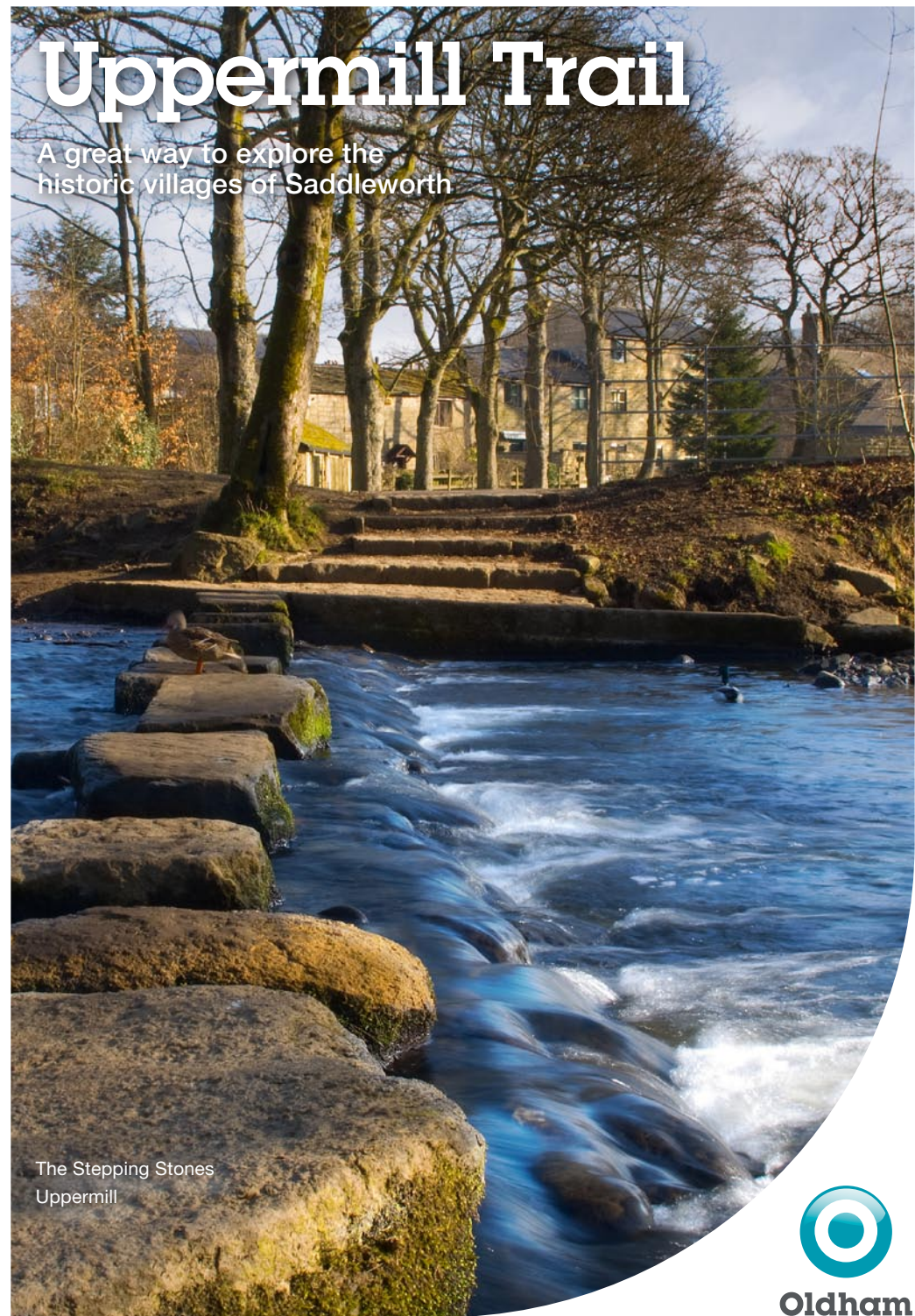
The Stepping Stones Uppermill

A great way to explore the historic villages of Saddleworth